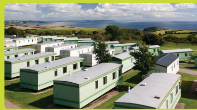
Tencreek Holiday Park

"I had never heard of embedded capital allowances claims on Holiday Parks until speaking with Zeal. I'm glad I ignored my accountant's advice initially. The process was hassle-free whereby Zeal acted professionally, securing my pool of tax savings and cash rebate swiftly, which I was delighted to receive!"