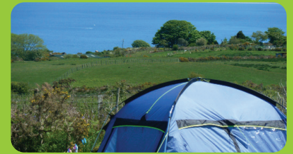
Willows Caravan & Camping

"Excellent from start to finish. Highly recommended. Professional, friendly and polite. Super communication all the way, money recovered with ease. The whole process was effortless, and within the blink of an eye a nice recovered tax sum in our account and tax deductions."