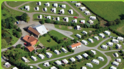
Highfield Holiday Park

Even if the original fixtures have been replaced or repaired or if the site has had significant renovations.