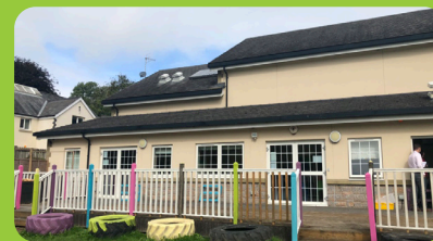
Orbis Special Education & Care

"We have worked with the team for years to help us optimise the tax relief on our investments in our education and care facilities. Their specialist knowledge and expertise has provided us with significant tax savings that we were not aware we could claim. We have been extremely happy with the level of service provided."