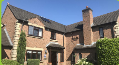
Ayuda House, Manchester

Even if the original fixtures have been replaced or repaired or if the property has had significant renovations.