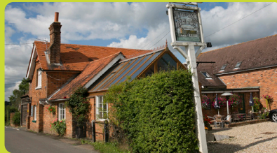
The Six Bells Pub

"We had no idea our business property was sitting on such a big entitlement! Zeal took the time to explain everything in detail. They took care of everything on our behalf, even when there was a query from HMRC. We cannot fault the service!"