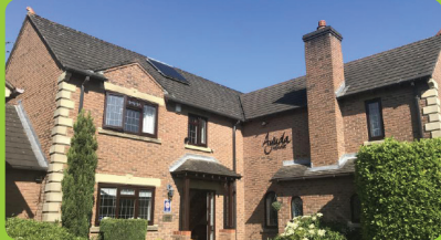
Ayuda House, Manchester

Even if the original fixtures have been replaced or repaired or if the property has had significant renovations.