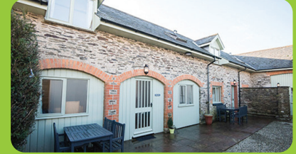
Smythen Farm Cottages

"Wow . . . I can't fault them in any way. It is not often you receive a call that leads to over 100K in tax savings. Well that's what happened. Fantastic service, great people to deal with and a speedy outcome."