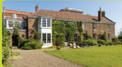
South Wing Holiday Home

"I came across Zeal during a PASC webinar. I contacted them and they explained the process and the benefits - basically a sizable capital allowance and a tax saving of almost £30k. The whole exercise took a few weeks, was super simple and the Zeal team explained everything very clearly. I highly recommend them."