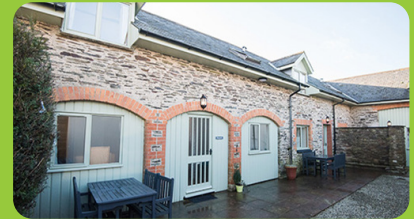
Smythen Farm Cottages

"Wow . . . I can't fault them in any way. It is not often you receive a call that leads to over 100K in tax savings. Well that's what happened. Fantastic service, great people to deal with and a speedy outcome."