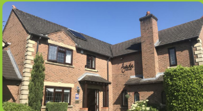
Ayuda House, Manchester

Even if the original fixtures have been replaced or repaired or if the property has had significant renovations.