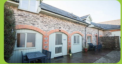
Smythen Farm Cottages

Allowances identified: £150,000 Future tax savings: £30,000 Cash Rebate: £2,500 Purchase Date: 2008