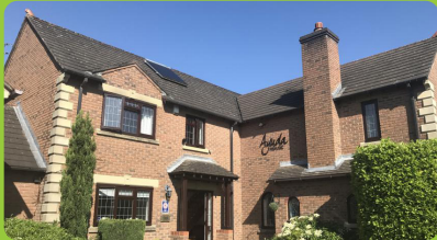
Ayuda House, Manchester

Even if the original fixtures have been replaced or repaired or if the property has had significant renovations.