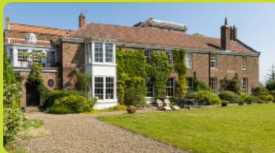
South Wing Holiday Home

Allowances identified: £146,722 Future tax savings: £42,500 Cash Rebate: £9,400 Purchase Date: 2007